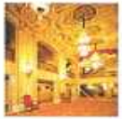
The Orpheum Theater was built in 1927 as a vaudeville house.