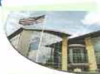
The Omaha World Herald is the largest employee-owned daily newspaper in the U.S.