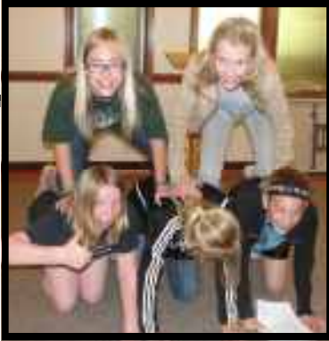
CONFIRMATION END-OF-YEAR FAMILY CINCO DE MAYO CELEBRATION