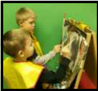
K-Prep students prepare works for the Art Show.