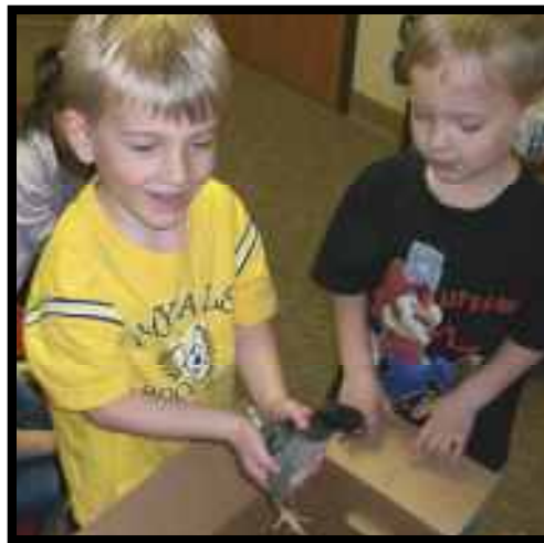
Baby chicks visit the Four year olds class.