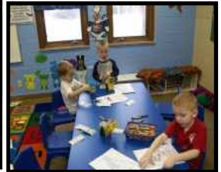
Three year olds working in the classroom together.