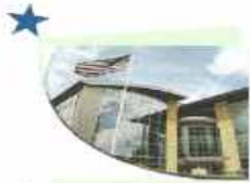
The Omaha World Herald is the largest employee-owned daily newspaper in the U.S.