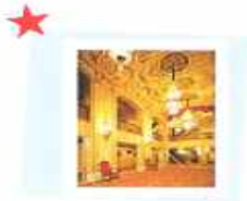
The Orpheum Theater was built in 1927 as a vaudeville house.